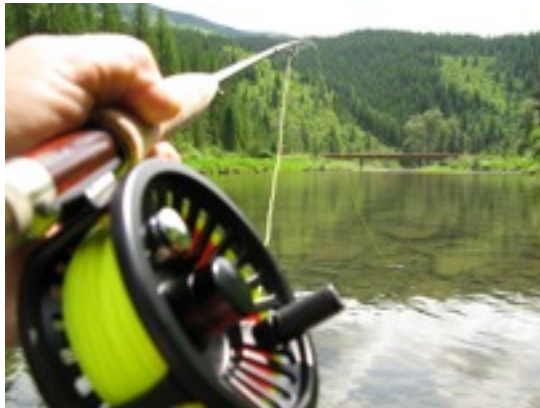
A view down the Coeur d'Alene River with a Loop Multi Reel and a hand-made St. Croix rod — built during last year's mid-winter NIFC rod building class — in the foreground.