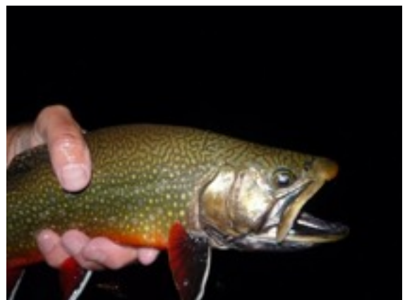
A brookie closeup at Georgetown Lake, MT, on Sept. 23.