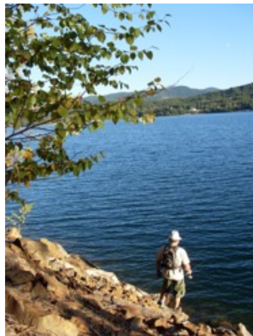
Greg Blythe on the Pend Oreille River.